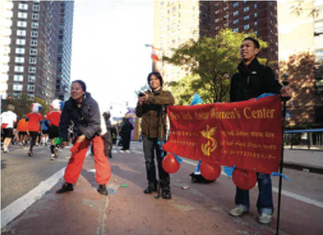
Cheering on the runners.

In honor of Valentine's Day, NYAWC clients celebrated the beauty in themselves with the help of Reveal. On February 11, 2012, Reveal volunteers pampered the women by providing head to toe makeovers— from stunning hairstyles and to shiny shoes. In addition to a souvenir of new outfits, the women walked away with fond memories of a relaxing afternoon they truly deserved.