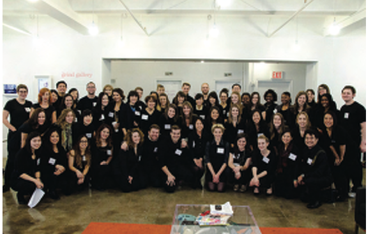
Reveal volunteers pampered the truly deserving women with head to toe makeovers that included stunning hairstyles and new outfits.